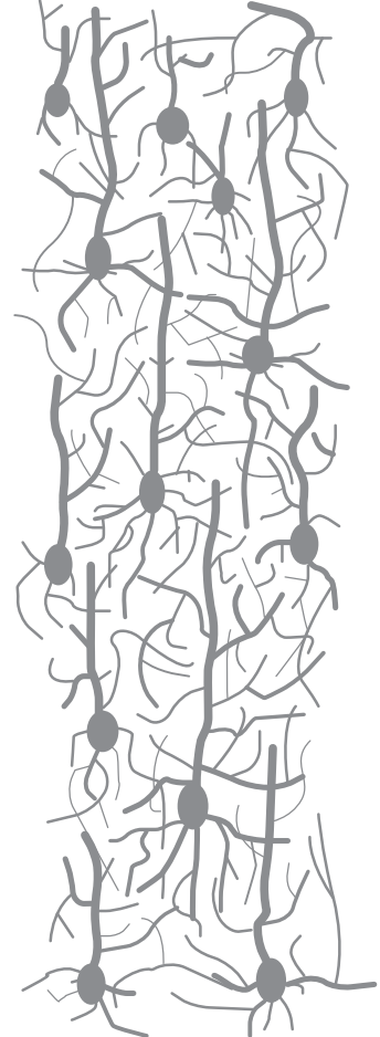
2 Years Old